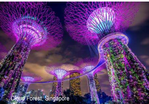
Cloud Forest, Singapore