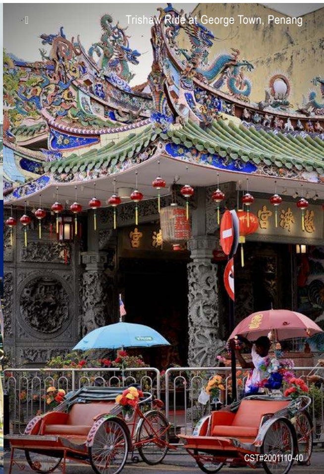
Trishaw Ride at George Town, Penang