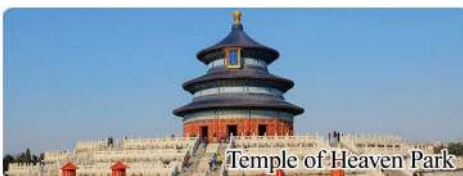
Temple of Heaven Park