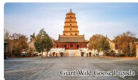
Giant Wild Goose Pagoda